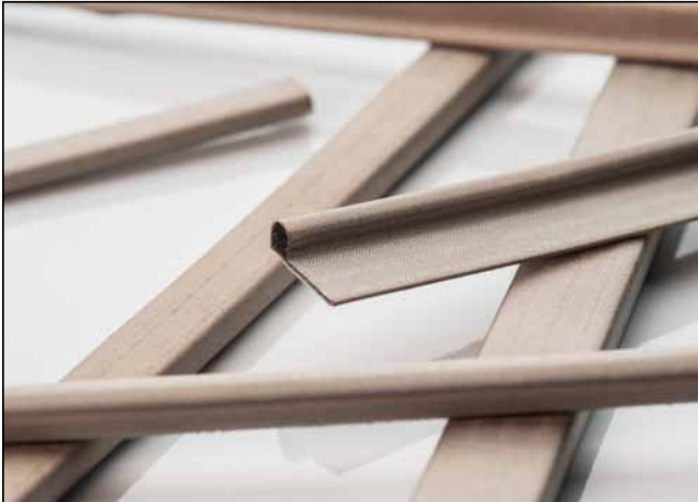
Ideal for the control of EMI, conductive fabric gaskets from Orbel are manufactured from a polyurethane foam core and wrapped with nickel-plated copper-conductive fabric.